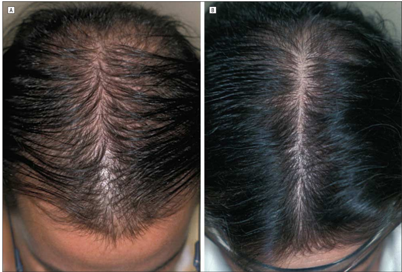
Figure 2. Ludwig pattern of hair loss shows great improvement compared with baseline (A) after 12 months of oral finasteride treatment (B).