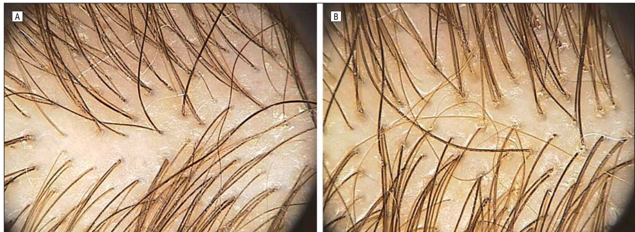
Figure 3. Improvement in the hair density score compared with baseline (A) at 12 months of oral finasteride treatment (B).

none of the patients reported adverse effects. This treatment was well accepted by the patients, who judged the results to be even better than did the investigators. The patient's opinion being generally more optimistic than that of the investigator is not surprising. In double-blind clinical trials on the efficacy of finasteride on male androgenetic alopecia, 13 patients treated with placebo reported improvement of their condition.